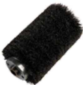
TUNGSTEN CARBIDE TIPPED